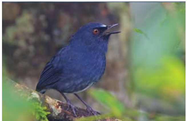
Fig. 3. White-bellied Shortwing B. albiventris, Munnar, Kerala.

This study was not directed at understanding the taxonomic status of the species, but was aimed towards an understanding of its phylogeography, and evolutionary history. In the process we found that the populations of shortwings had clearly separated into two different species over the last five million years. Unfortunately, we cannot ascertain the genus-level status of the species. There is only a single sequence of a Brachypteryx (B. montana) individual from north-eastern India that is available publicly. Our genetic studies indicate that B. major is not close to B. montana; other Brachypteryx spp., have, however, not been examined. This means that Brachypteryx could be close to Myiomela, Cinclidium or some other chats. As there is currently no genetic information available for all these congeneric spp., we currently cannot conclude to what genus this species belongs. We are collaborating with other groups of researchers who are working on similar taxa, to be able to examine this very soon. Meanwhile, we have proposed that a status quo be maintained